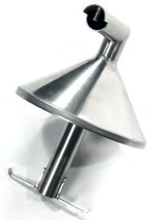
Extra insulated stainless steel drying hopper, supplied with removable air distributor for easy cleaning.