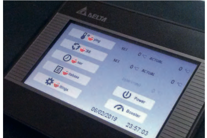
PLC control is standard on the DMR range.