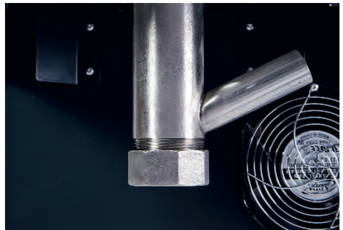
Slide valve and catchbox with drain port is standard on the DMR range.